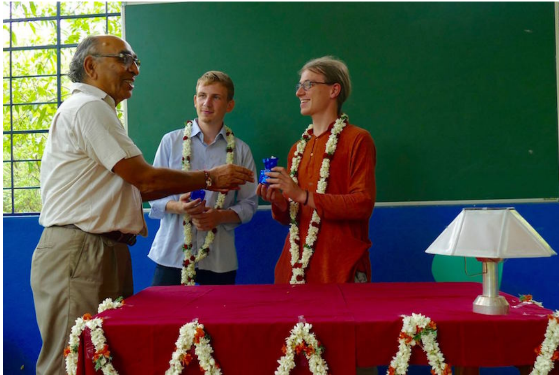
Farewell and thanks to the two 'Weltwärts' volunteers + solar lamp.