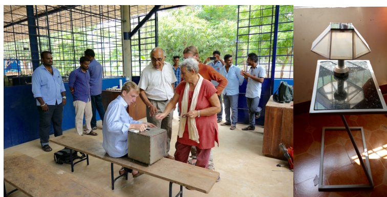
Oven as an attachment on a gas stove + table with solar lamp

* The solar lamp, the table, the oven as an attachment to an open gas flame and a prototype for a smoke-free cooking area are all products that we hope to be able to market.