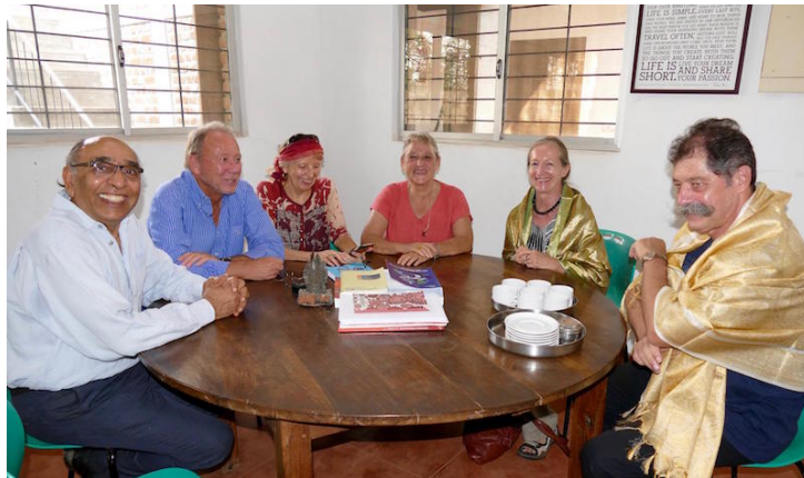
The guests of honour received a scarf