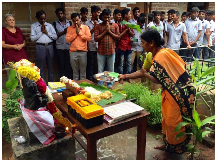
One of the AIAT-'Ammas' leads the ritual