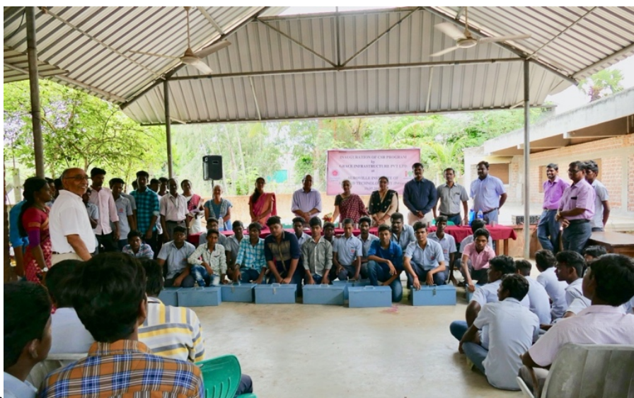
CSR Inauguration and symbolic handover of toolboxes from General Manager/Grace and his team to AIAT students.

Furthermore, the Grace Infrastructure also donated cash to purchase tools and material for toolboxes to be made in AIAT welding workshop. These toolboxes made in our workshop are being handed over to the trainees of Fitter trades.